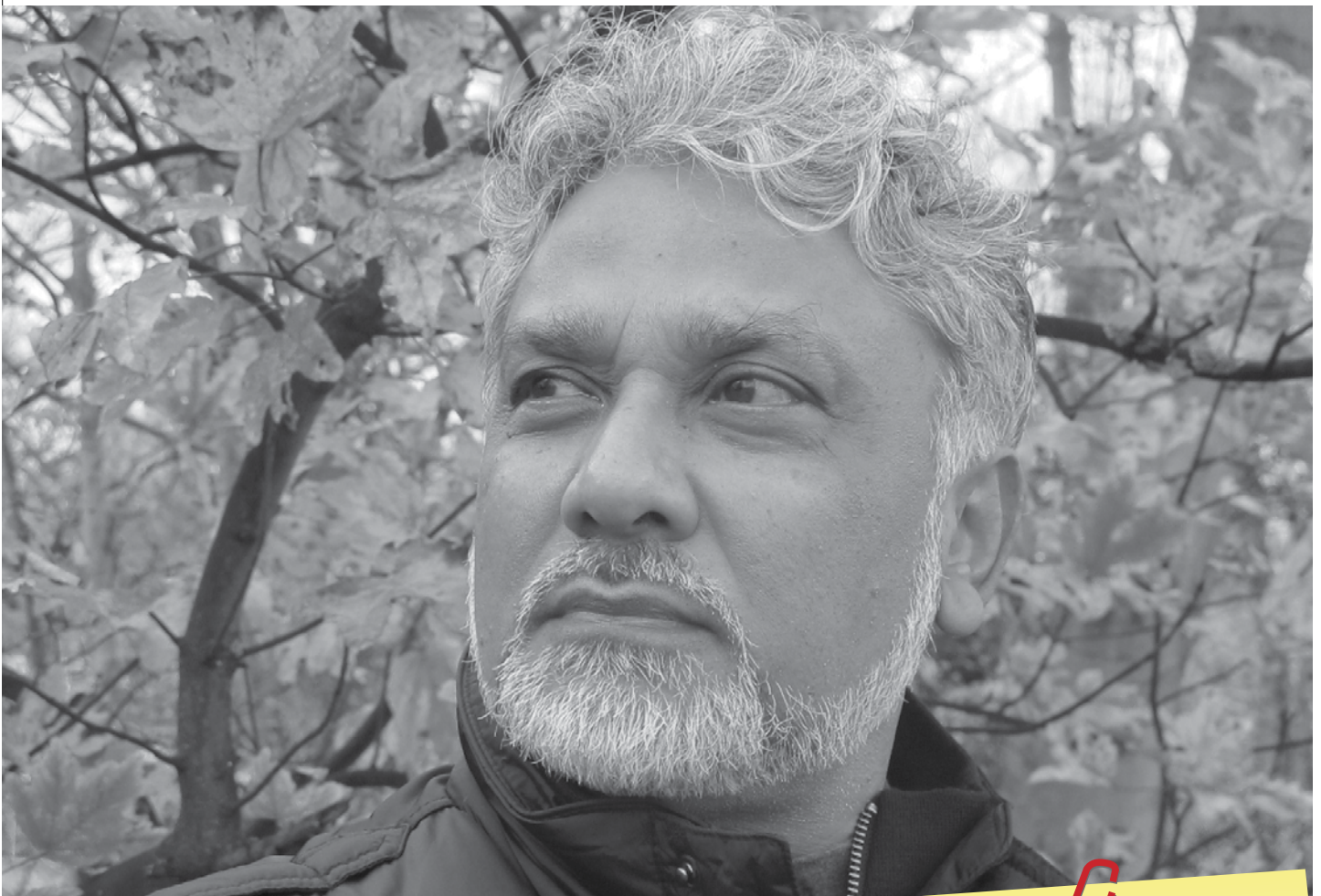
Kunal Basu is the author of The Japanese Wife , which is also made into a film by Bengali filmmaker Aparna Sen